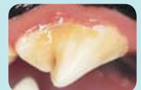
Unhealthy mouth with gingivitis and calculus