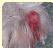
Paw of a dog with an interdigital cyst caused by a grass seed