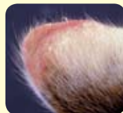
Ear tip of a cat showing cancerous changes