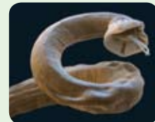
Adult A. vasorum lungworm These live in the heart and pulmonary arteries

Lungworm infestation, caused by the parasite Angiostrongylus vasorum is something that all dog owners should be aware of. Angiostrongylus vasorum can cause a wide range of symptoms – some severe, including coughing, lethargy, fits and blood clotting problems. However other pets may show no obvious signs of problems.