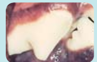
Healthy mouth with white teeth and healthy pink gums