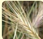
Grass awns of the summer grasses